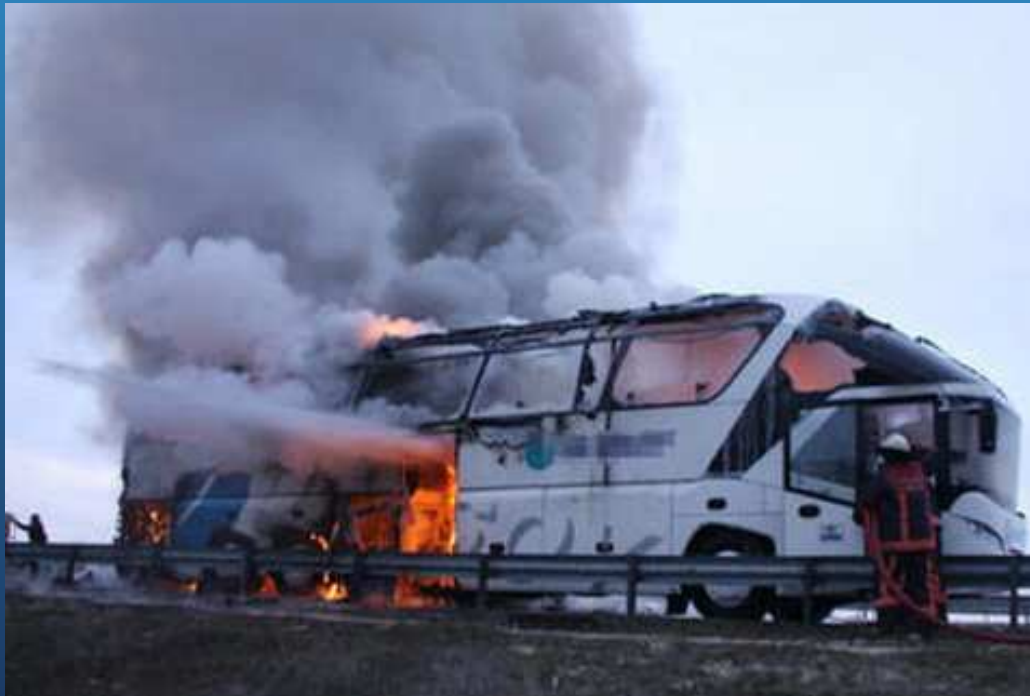
Coach fire in Turkey.